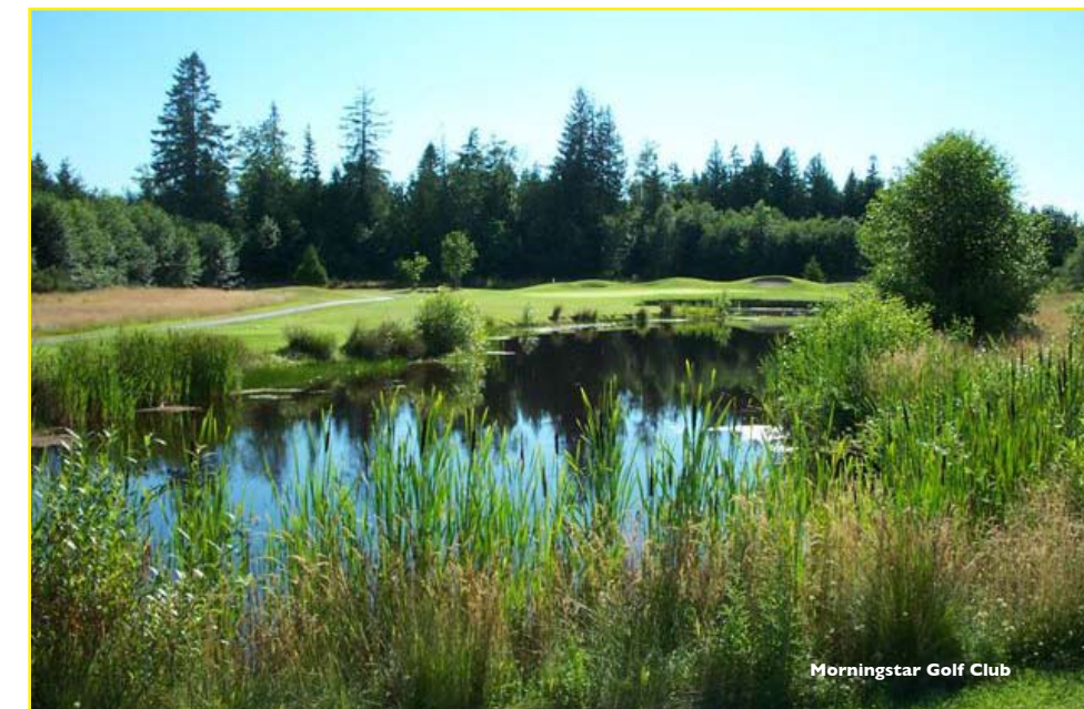
Morningstar Golf Club