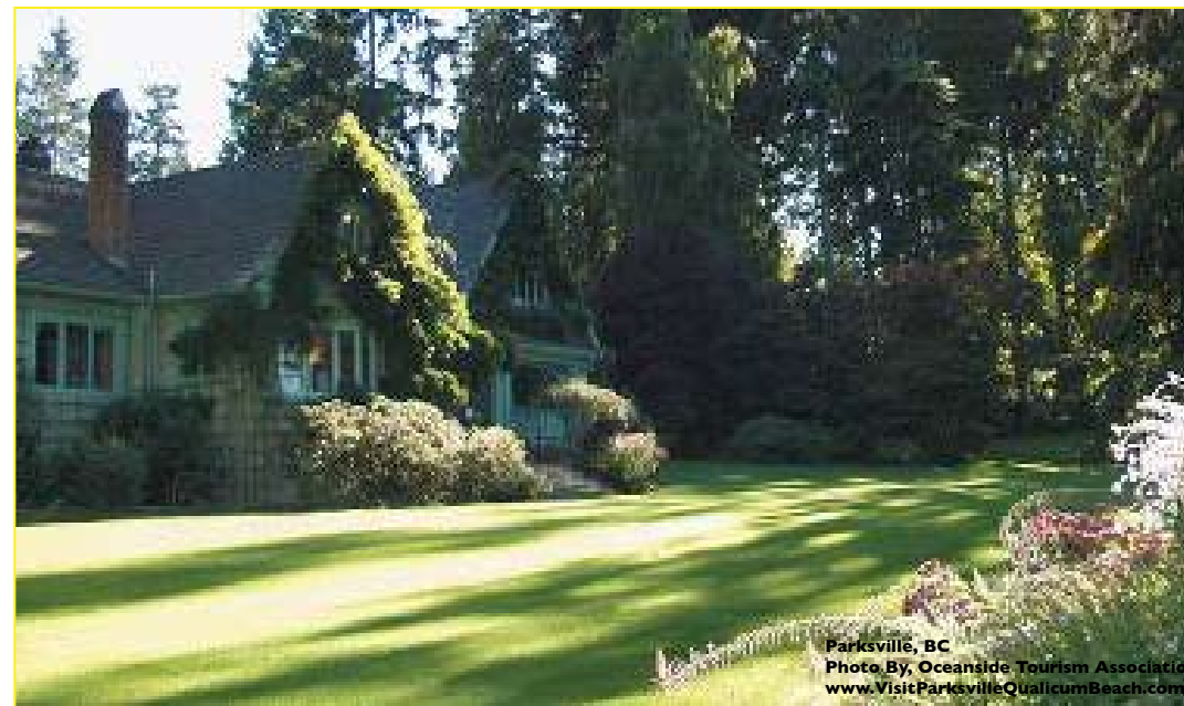
Parksville, BC